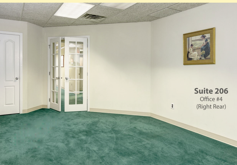
Suite 206 Office #4 (Right Rear)