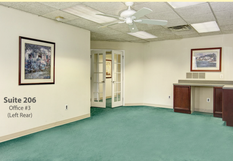
Suite 206 Office #3 (Left Rear)

PAVILIONS OF VOORHEES 2301 EVESHAM ROAD, UNIT 206 VOORHEES, NJ