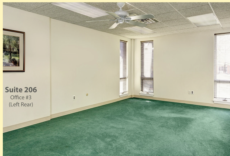
Suite 206 Office #3 (Left Rear)